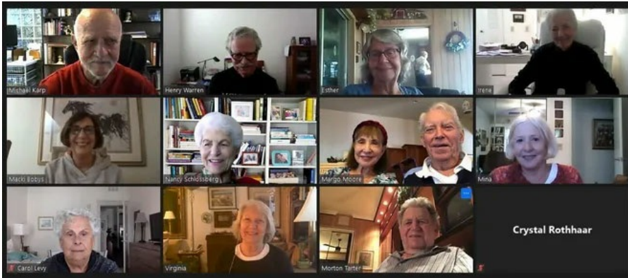
The Aging Rebels