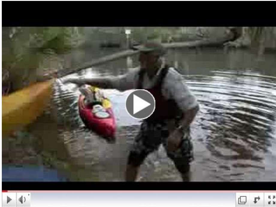
Explore Sarasota's Snook Haven Park!

Get ready to unlock a lifetime of discovery with Sarasota County Parks, Recreation and Natural Resources and the National Recreation and Park Association (NRPA).