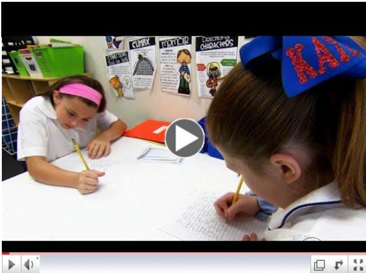
Students connect with other generations through letters in cursive

CBS News recently featured a story about the friendships forged as older adults became pen pals with third graders learning the fading art of cursive writing.