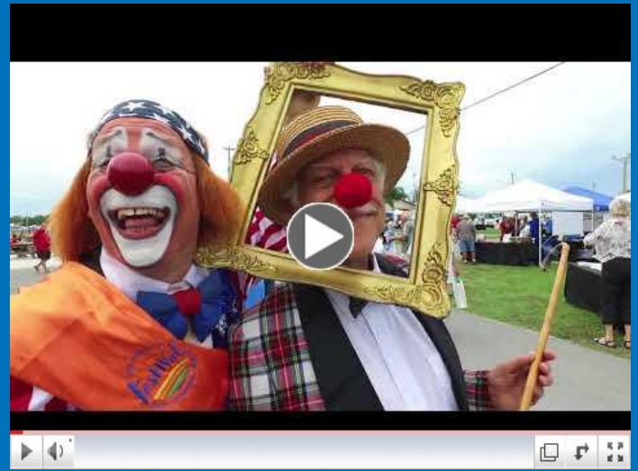
Age-Friendly borrows a Muppet tune for their Work, Live, and Play Song Parody

Join the Sarasota Manatee Metropolitan Planning Organization and the City of Sarasota, Government for an afternoon as they gather community input for the