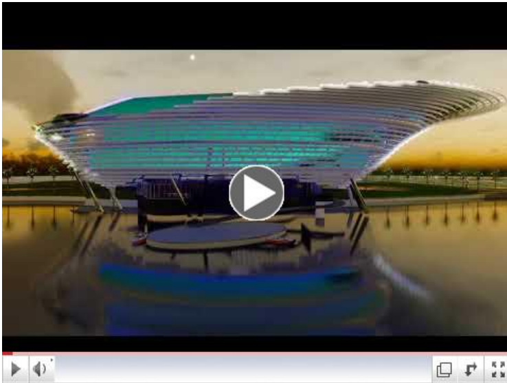
Rendering of light effects at new Mote Marine aquarium