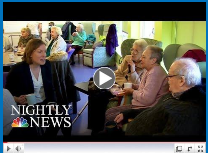
U.K. Combats Solitude With A New Minister Of Loneliness