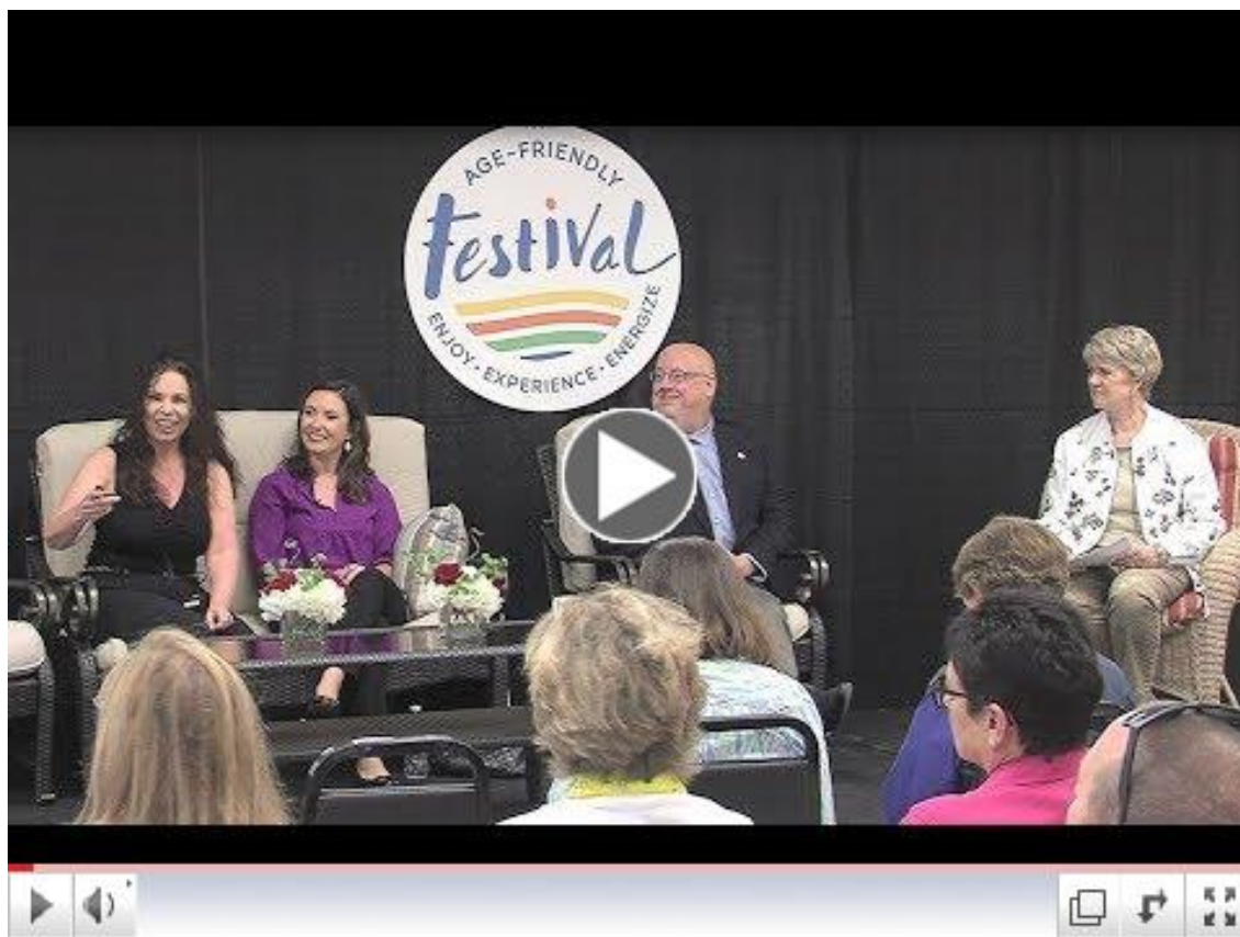
Age-Friendly Innovation - National, State, and Local Perspectives