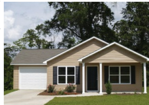
A no-step entrance, covered entryway and one-story living helps make this home age-friendly.

The theme for the event is Housing and Sustainable Urban Development – which recognizes the reciprocal impact of the environment on aging persons. We too recognize the importance of our homes and community - and all that it means to us!